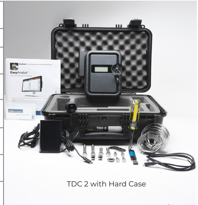
TDC 2 with Hard Case

Specifications are subject to change without notice.