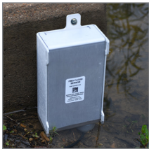
Flood / Water Level Detector