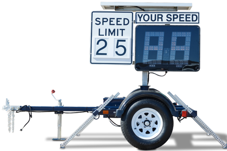
SAM-R in towing mode

It's a versatile, lightweight speed alert trailer rugged enough for continuous duty.